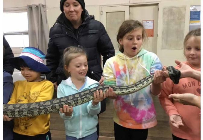
Year 2 Camp, Victor Harbor