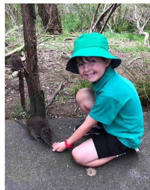
Year 1 Camp, Cleland Wildlife Park