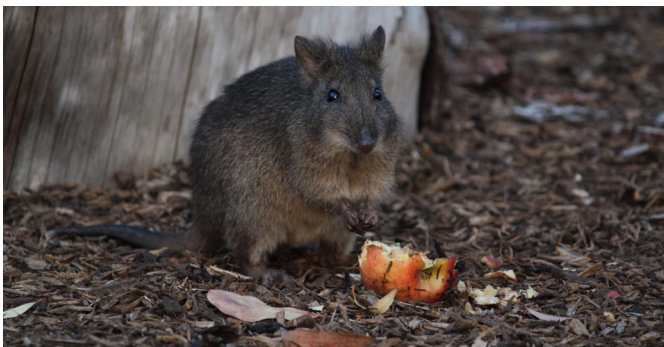
A healthy Harry the potoroo

ENVIRONMENTAL RESOURCE OFFICER AND CONSERVATION LAND MANAGEMENT TRAINER