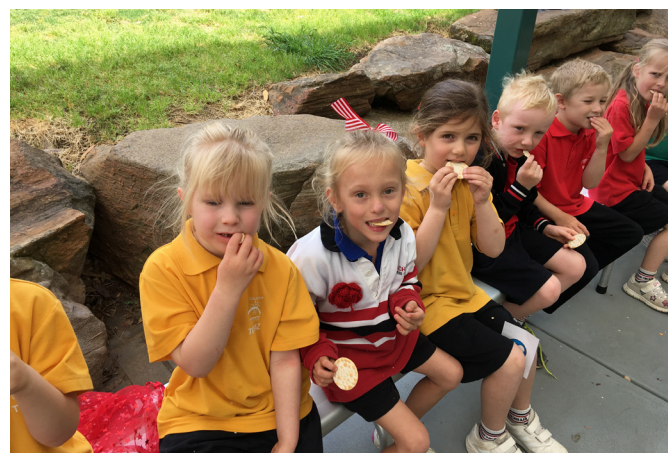
Students eating dry crackers at recess as part of ALWS Day