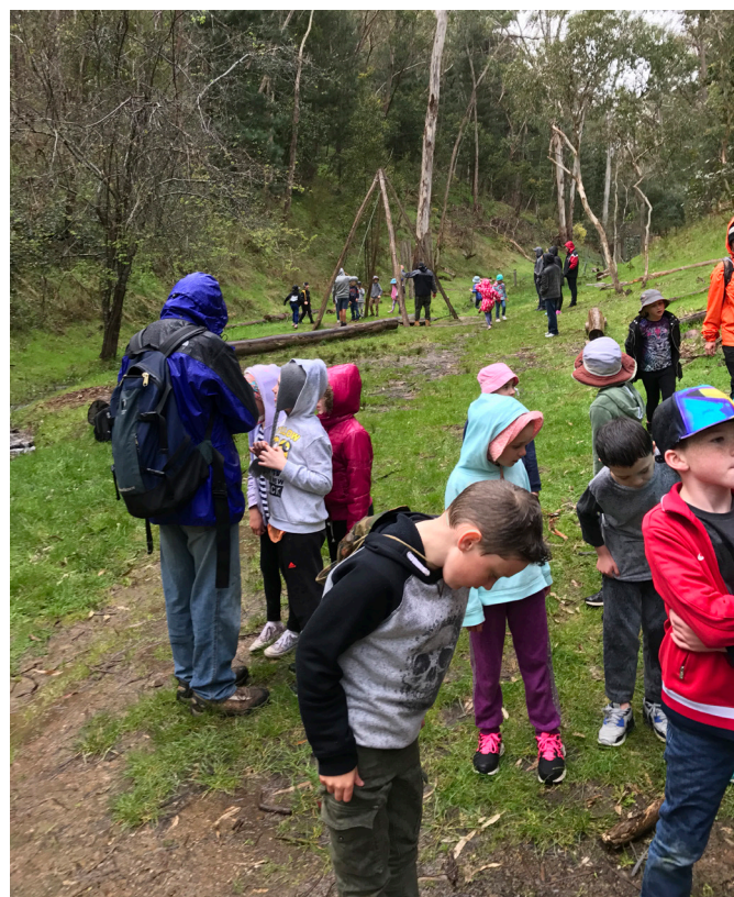
Year 2 Camp