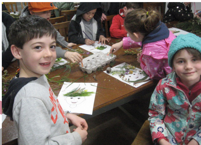
Students take part in activities on the Year 2 Camp