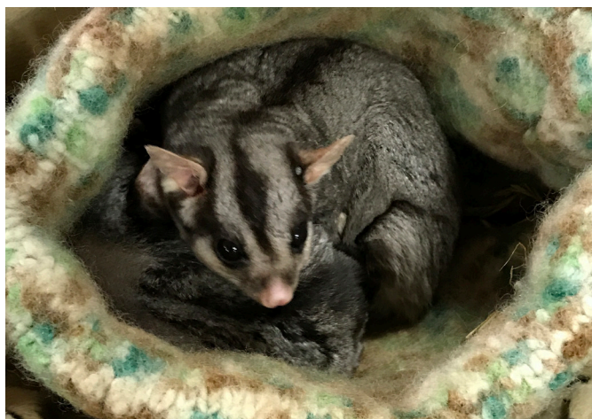
Glider Possum, Year 2 Camp