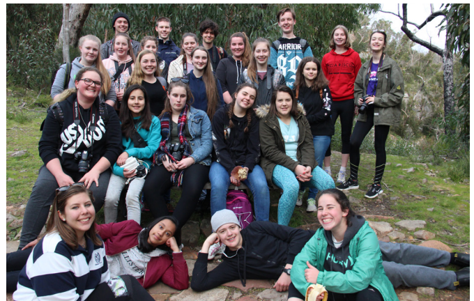
Year 10 Creative Camp