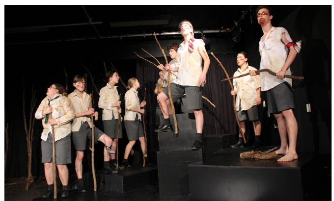
The Year 12 Drama production of The Lord of the Flies