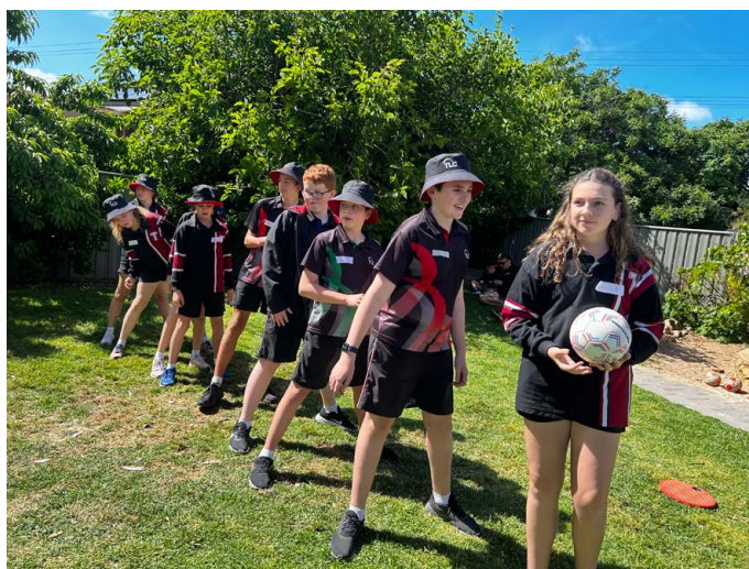
Middle School students helping at the Montessori Sports Week