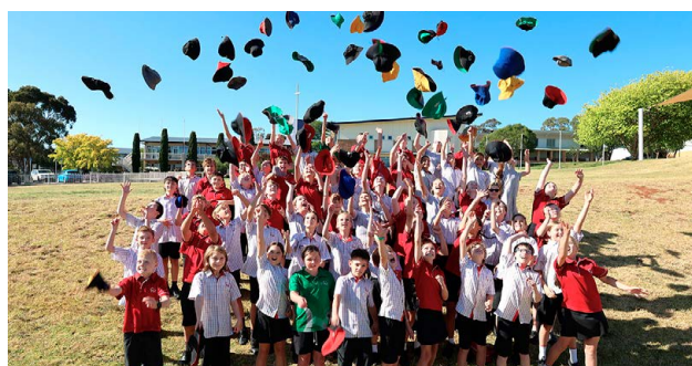
Year 6 students graduating from Junior School