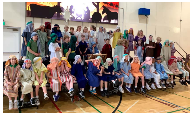
Nativity chapel service, Reception, Year 1 and Year 2 students