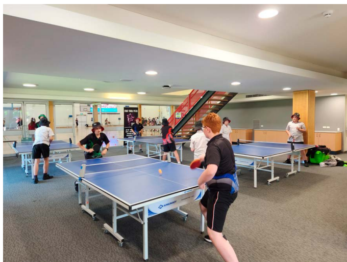
Middle and Senior School table tennis club