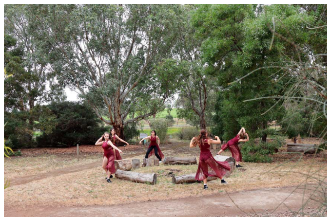
Year 10 Dance students in the EcoClassroom Sanctuary