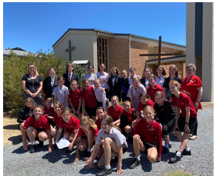
Junior and Senior Choir groups at St Paul's Lutheran Church