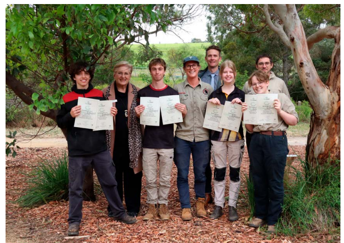
Students complete their Certificate II in Conservation and Ecosystem Management and Horticulture