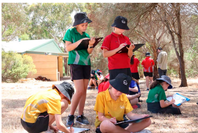
Year 5 students visiting the EcoClassroom Sanctuary