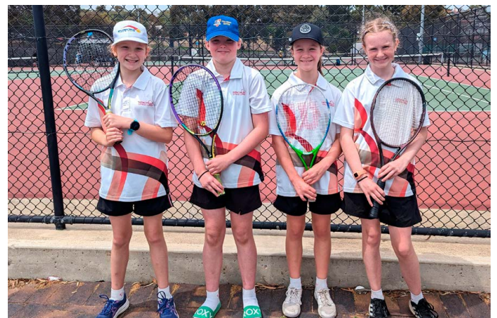
The Tatachilla tennis SAPSASA team