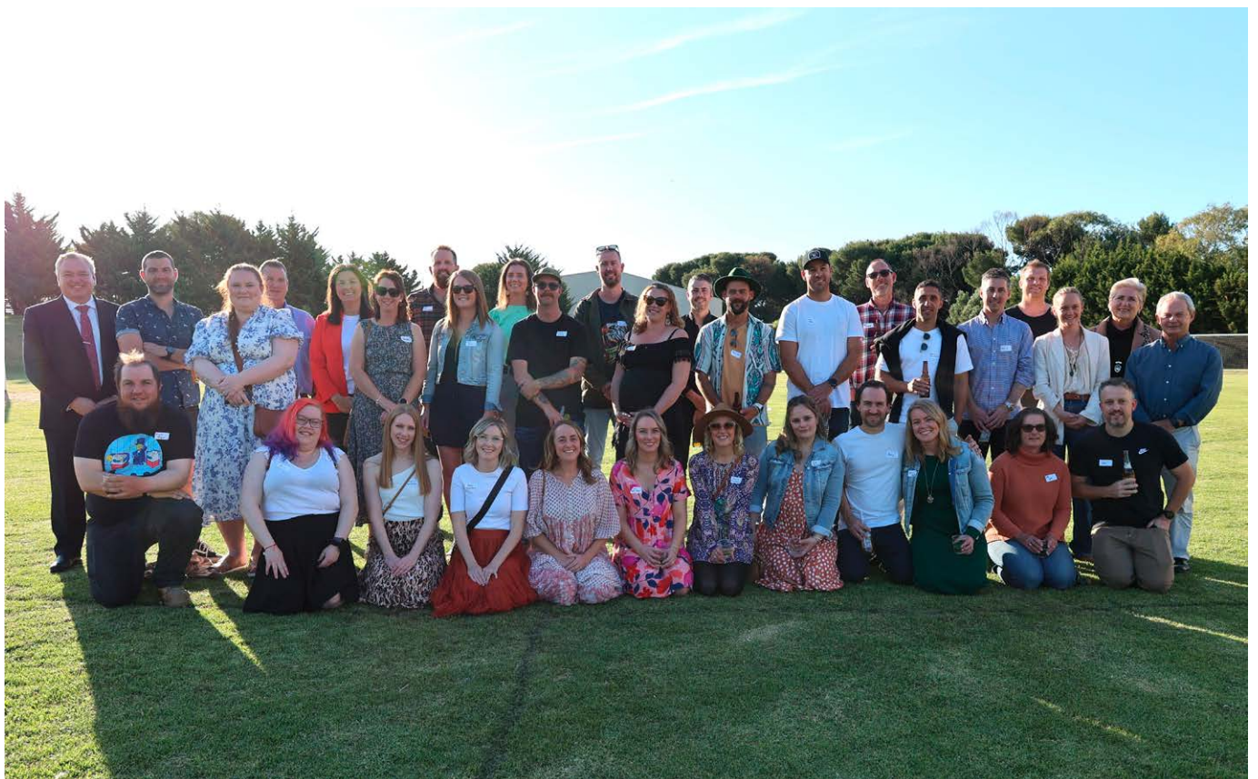
Old Scholar Reunion, Class of 2003