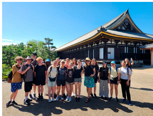
Japan Tour 2023