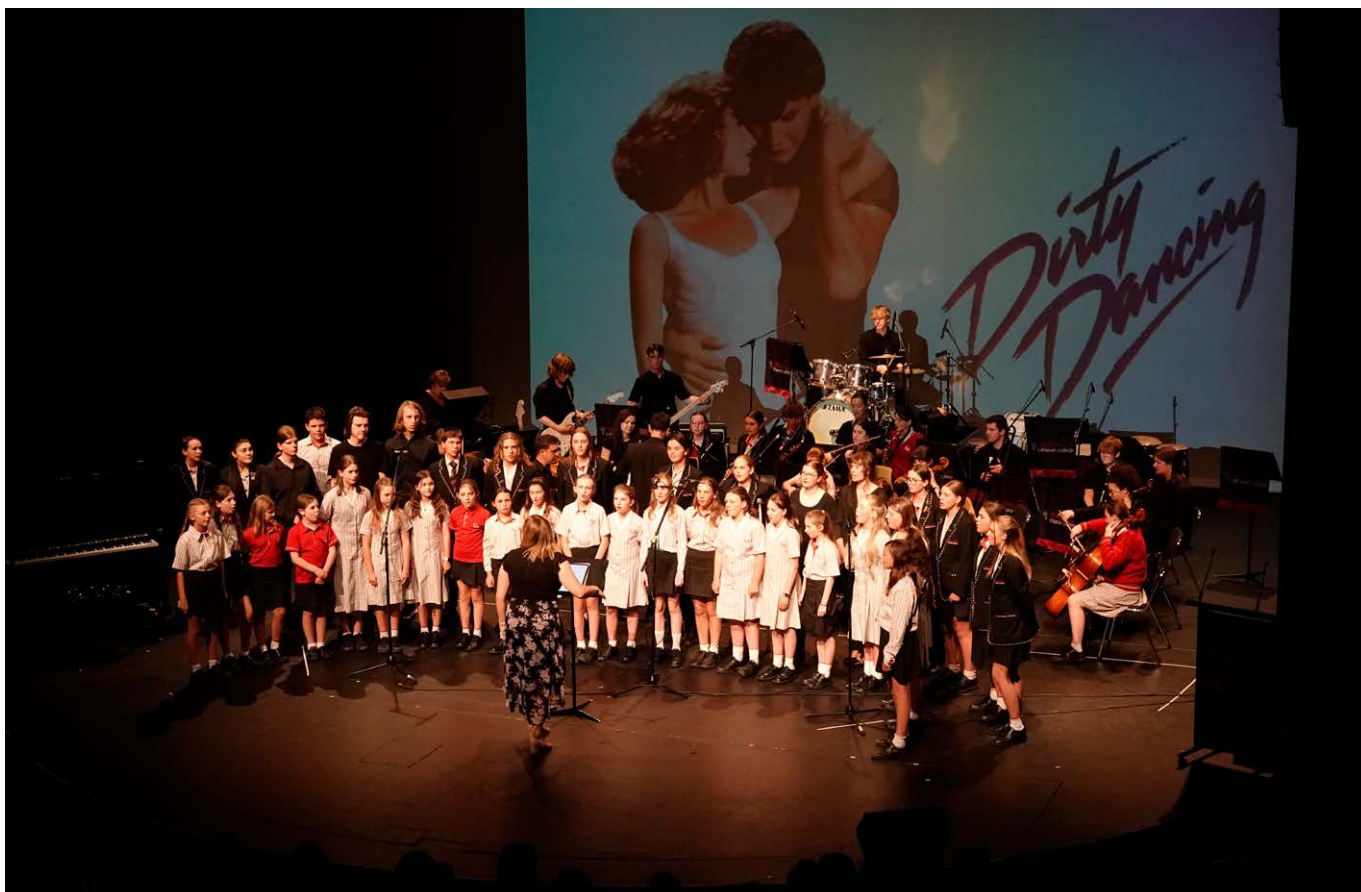
Music Showcase - the grand finale