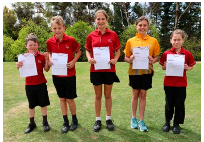
Junior School Excellence Award winners