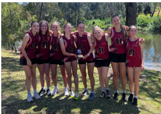
The junior girls team with their 1st place trophy

7-12 HEALTH AND PHYSICAL EDUCATION LEARNING LEADER