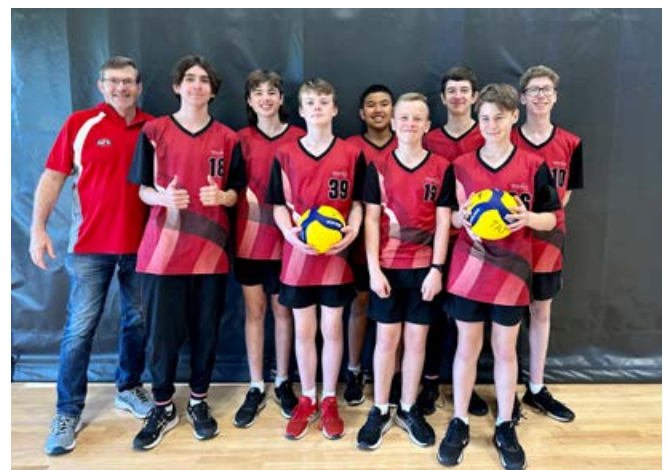
Year 7/8 boys' volleyball team