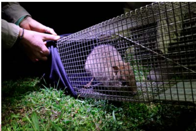
CEM trapping night