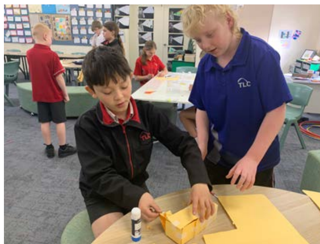
Year 6 students during Science Week