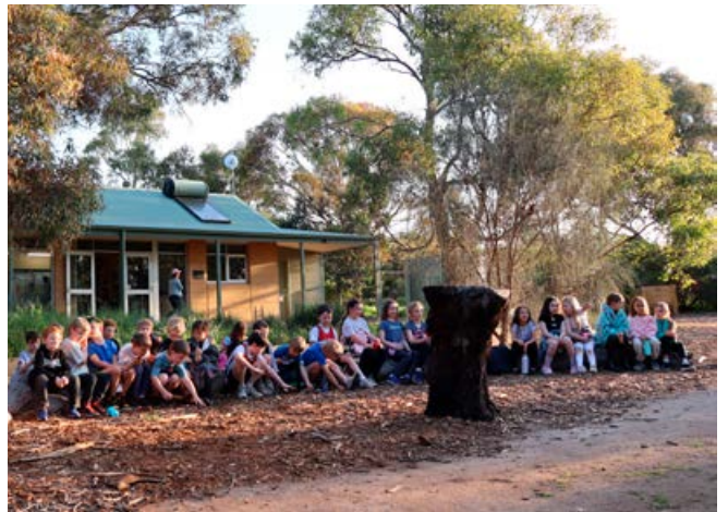
Year 2 extended stay at the EcoClassroom