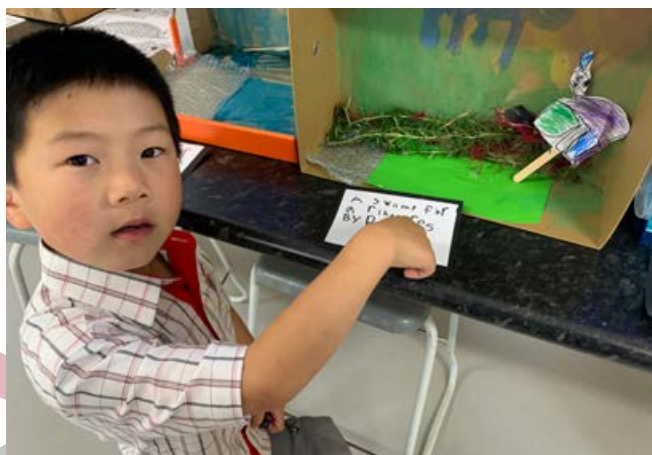
Reception habitat exhibition

Student-led conferences were initiated in Years 7 and 8 last week, and parent attendance was pleasingly high, matched by students' capacity to reflect knowledgeably about their learning. There was a buzz in the courtyard, resulting from the opportunity to welcome parents into our school, further valuing our student/parent learning partnerships. Well done to students, staff and parents who engaged so positively in this initiative. Please read more about the Reception to Year 6 student-led conferences in Amy Watson's article on the following page.