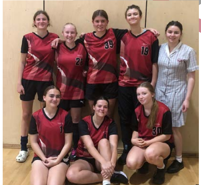
Year 9/10 girl's indoor soccer team