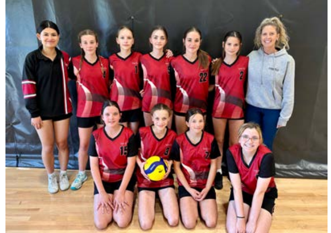
Year 7/8 girls' volleyball team