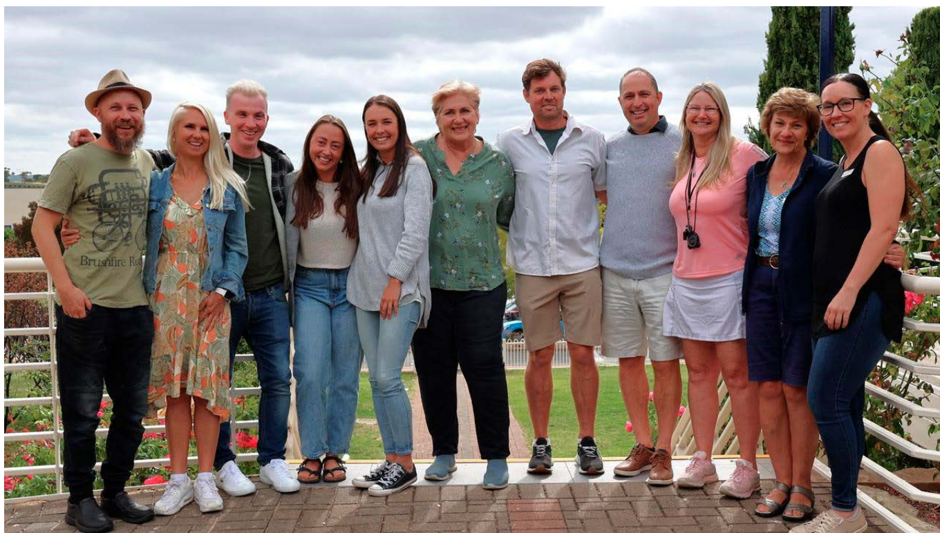
Tatachilla nominees for Australia's Best Teacher series