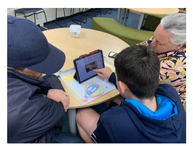
Student Led Conference in the Junior School