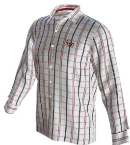
Long or Short Sleeved Shirt