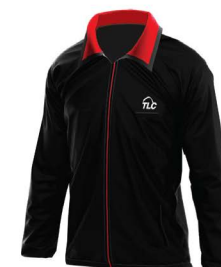
Soft Shell Jacket