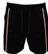
Boys Sport Shorts