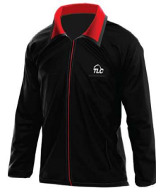
Soft Shell Jacket