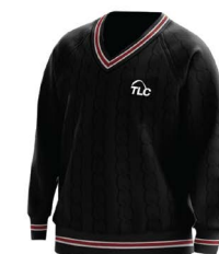
Black Jumper (Senior School only)