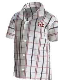
Short Sleeved Blouse