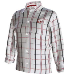
Long Sleeved Shirt