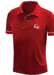
Cardinal Red Polo Shirt