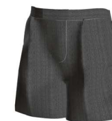
Girls and Boys Shorts