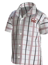
Girls Blouse (long sleeved or short sleeved)