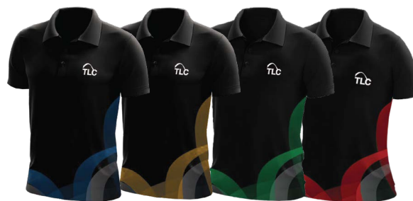
Sport and House Polo Top