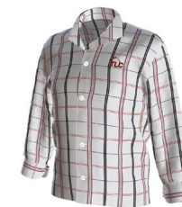
Long Sleeved Blouse