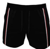
Girls Sport Shorts