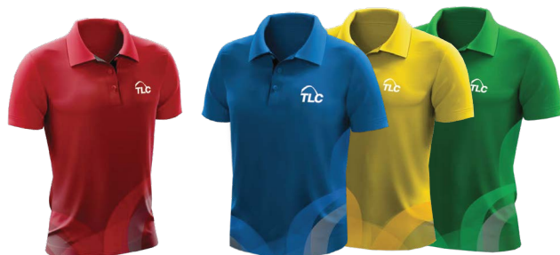
Sport and House Polo Top