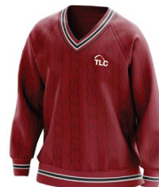
Cardinal Red Jumper