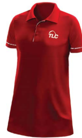
Cardinal Red Polo Dress