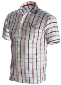
Short Sleeved Shirt