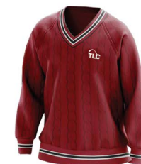
Cardinal Red Jumper (Middle School only)