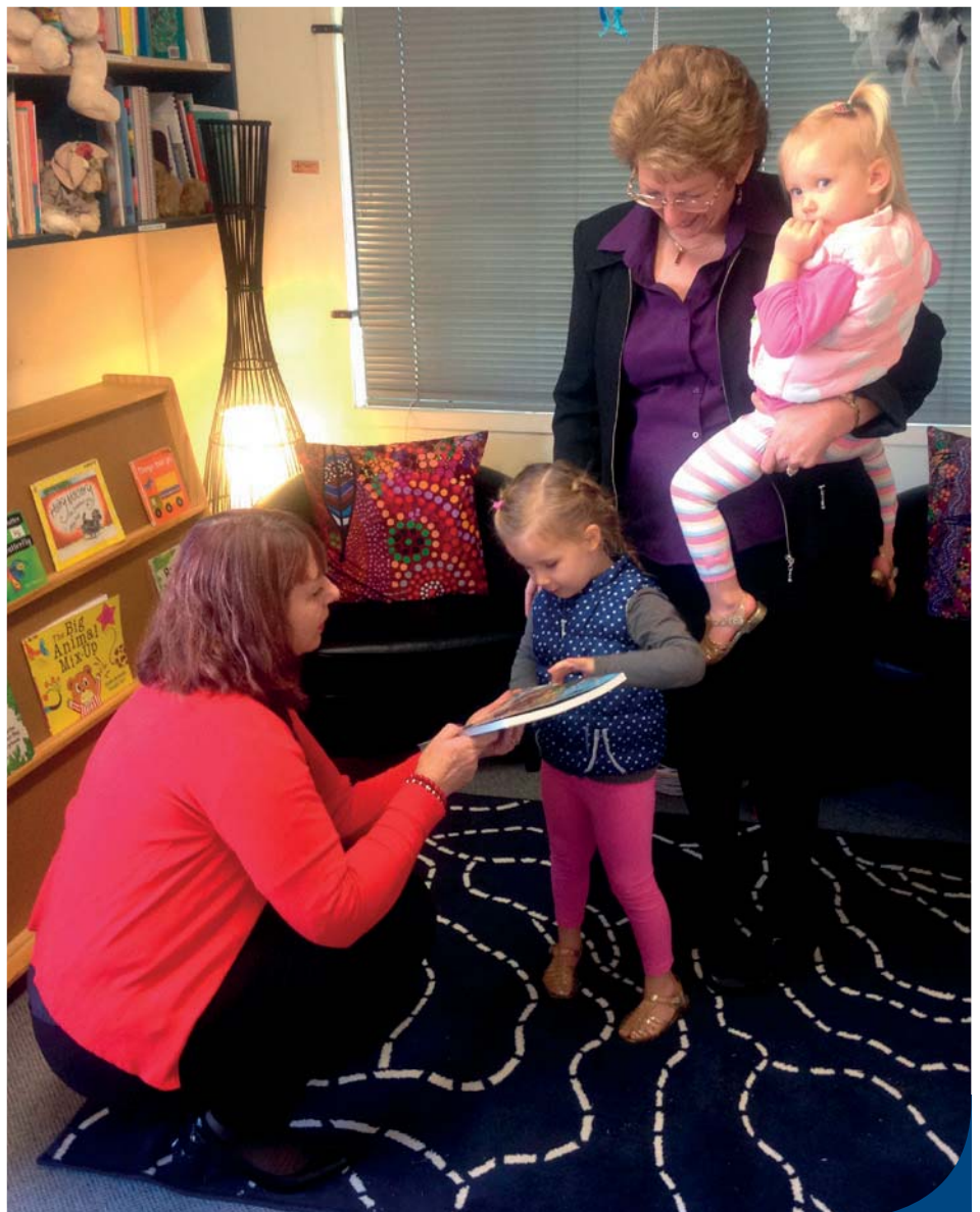
Children's learning experiences begin at birth and the first five years are a particularly critical time for socio-emotional and cognitive development.

Children are active learners drawing on direct physical and social experience, as well as culturally transmitted knowledge, to construct their own understandings of the world around them. Children contribute to their own development as they strive to make meaning out of their daily experiences in the home, in church and in the community. Children's early learning is distinct and foundational. It establishes the patterns for successful schooling and lifelong learning. The concept of developmentally appropriate