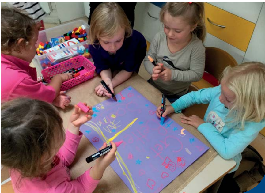
Children making a get well card