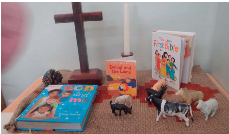
Sacred spaces have been created in every room

Our kindergarten is inclusive of children from all cultural, social, economic and religious backgrounds and we aim to provide a respectful and tolerant education for all. Our committee of management, in conjunction with the congregation, has been able to provide all kinds of assistance for families in need over the years. The congregation set up an emergency support fund to provide financial assistance for fees, groceries or meals for families affected by illness