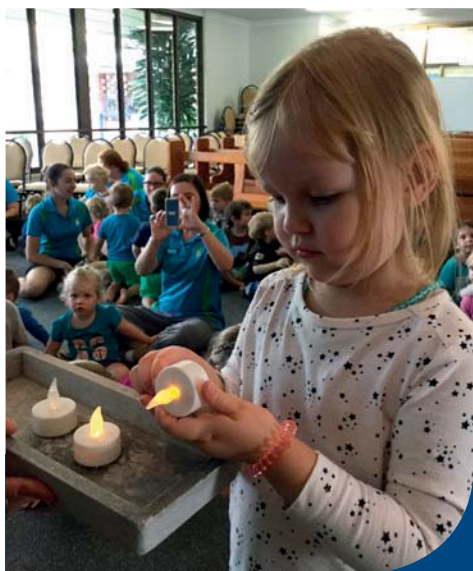
Worship at St Pauls ELC Townsville