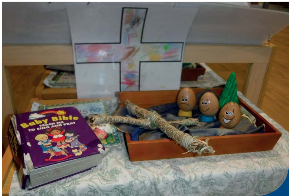
We help each child understand they can talk to God in any way

We encourage them to kneel or stand to pray. They can say loud or quiet prayers, they can sing their prayers. When it comes to teaching children about prayer we feel that if they can