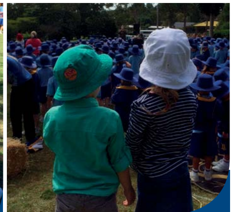
Bethania is accommodating of the needs of our children and show great understanding of the occasional need to modify events for the age group.