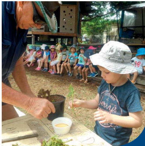
Congregation members help with gardens