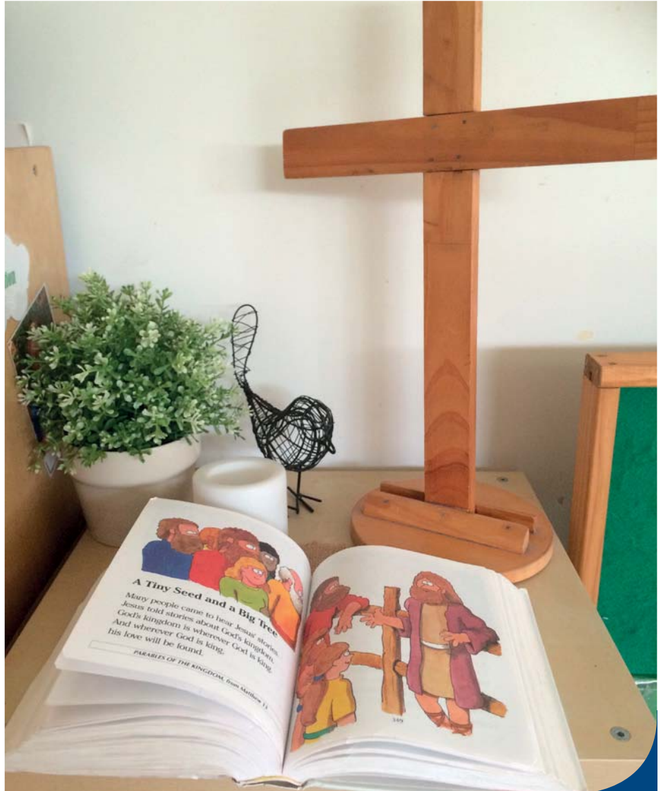
We also see, not only a responsibility but an opportunity, to bring the gospel message to our children, their families and carers and also to our staff.

All forms of education will have a particular perspective on life. It may not always be obvious or overtly stated, but it will shape