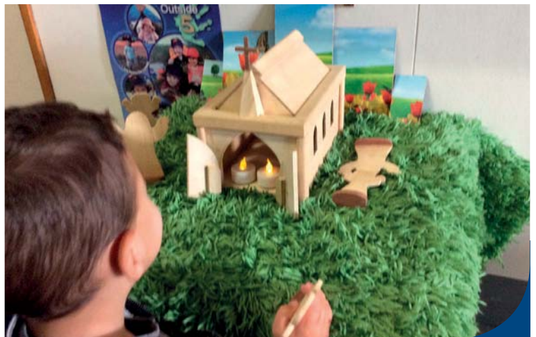
Children are invited to celebrate peace and love through the stories of the Bible