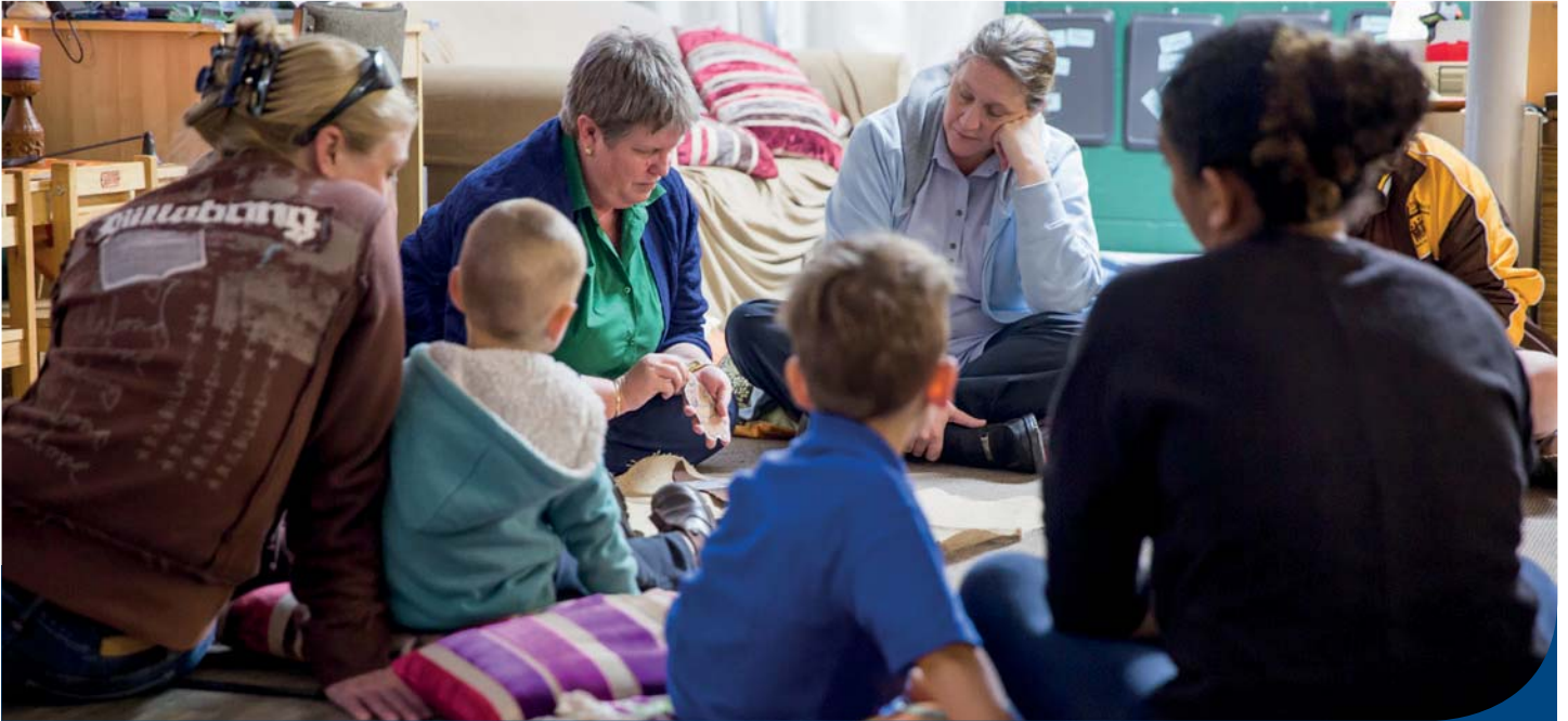
As the story is told, eyes follow, heads nod and children and parents draw physically closer to one another

not something we find much time for in our busy daily life. The work produced is proudly shared during the feast, along with general conversation. Simple crackers, juice and dried fruits form the basis of the food, although we also include fresh bread, made in our bread maker on a regular basis. Sometimes, the artists choose to leave their work to be included in our sacred space. At other times, the work goes home to remind the creators of the experience.