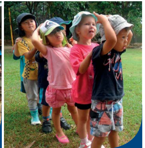
St John's serves the needs of a diverse kindy