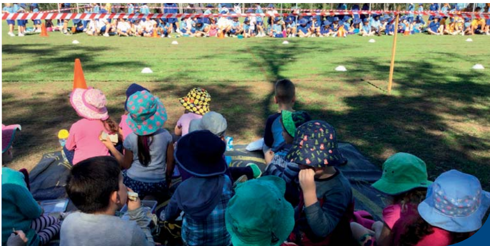
Our children are invited to attend and participate in a variety of school events