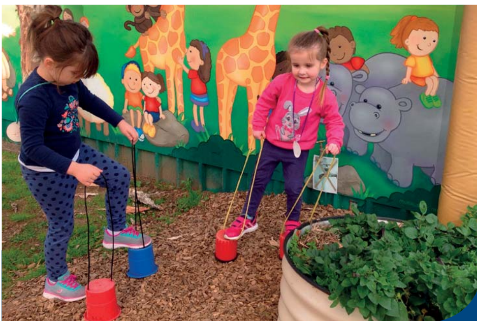
It [is] a privilege to serve the community with quality Christian preschool education during this time.