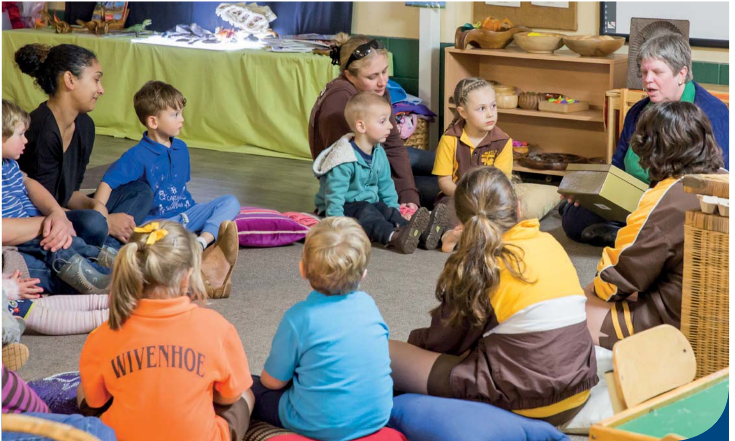
The Godly play experience - the story, the wondering, the response time and finally the feast